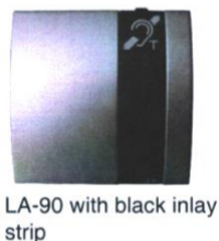
LA-90 with black inlay strip

Note: When switched on, the green light on the back and the blue light on the front of the LA-90 will be lit. The microphone and handset are ready to use.