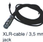
XLR-cable / 3,5 mm jack